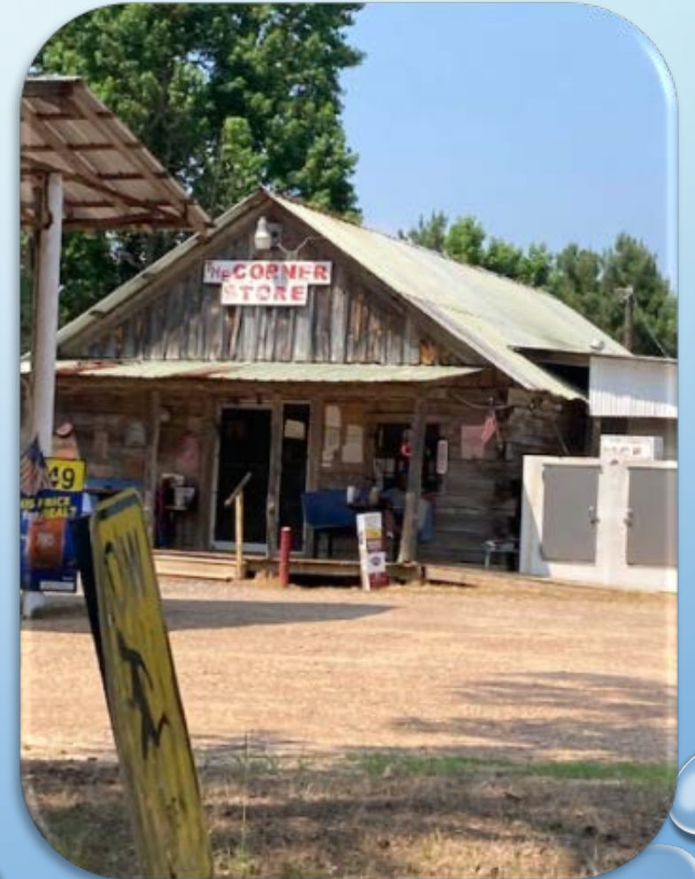
The Corner Store – Ringgold, LA