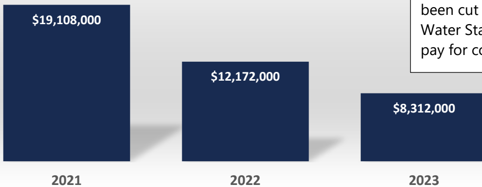
Federal Funding for Drinking Water SRF Projects Cut by $17.7 Million