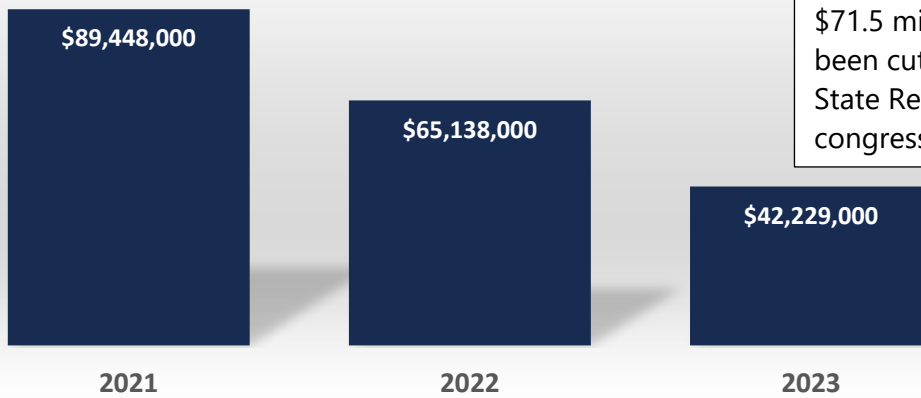
Federal Funding for Clean Water SRF Projects Cut by $71.5 Million