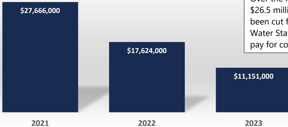
Federal Funding for Drinking Water SRF Projects Cut by $26.5 Million