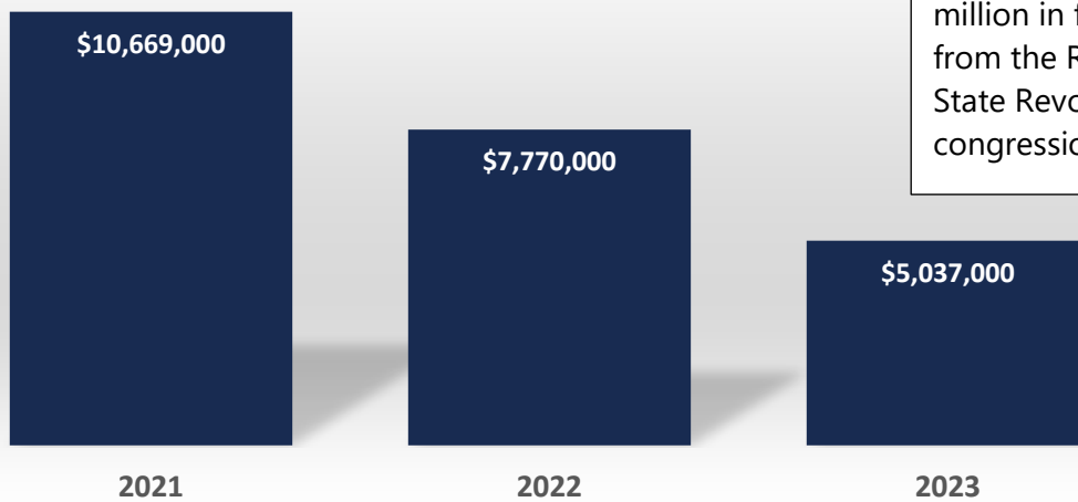
Federal Funding for Clean Water SRF Projects Cut by $8.5 Million