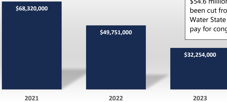
Federal Funding for Clean Water SRF Projects Cut by $54.6 Million