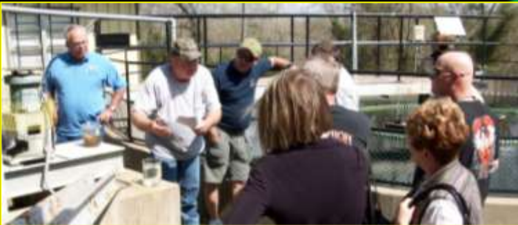
Class tour during operator training course