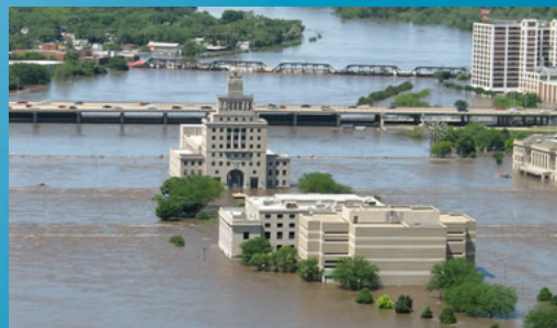
Downtown Cedar Rapids