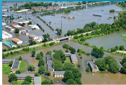
Iowa City – University of Iowa