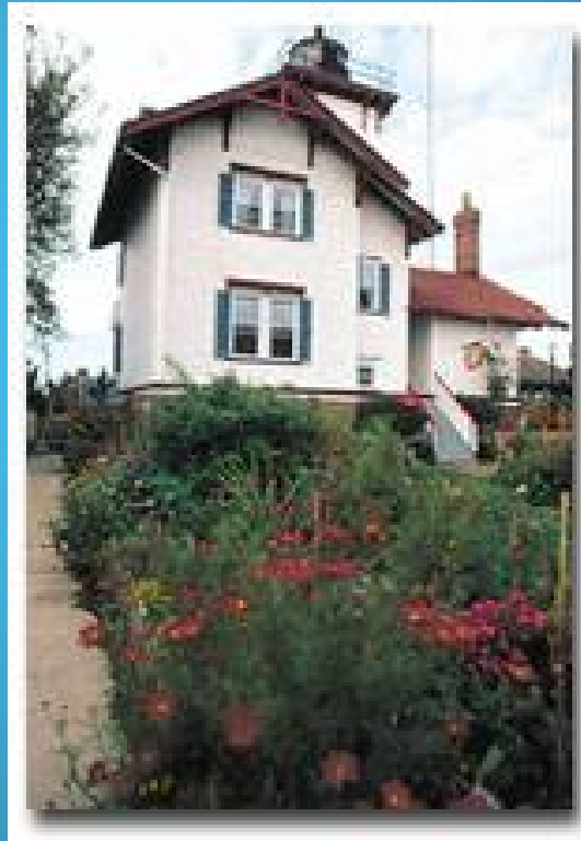
Hereford Inlet Lighthouse