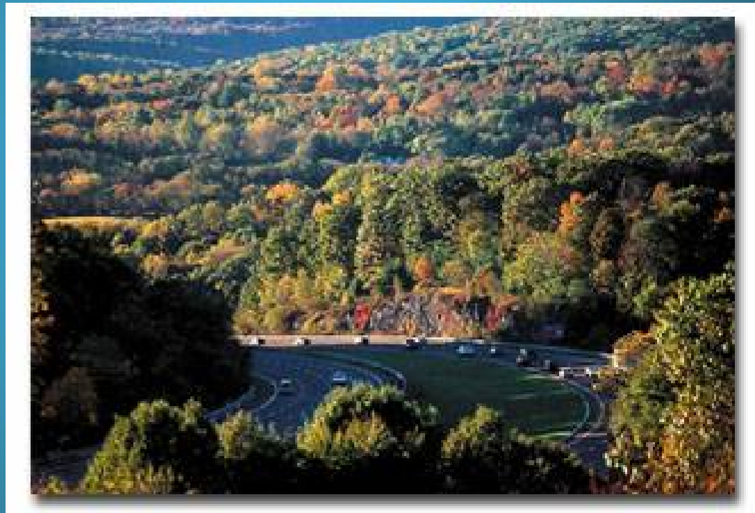
Route 80 - Delaware Water Gap