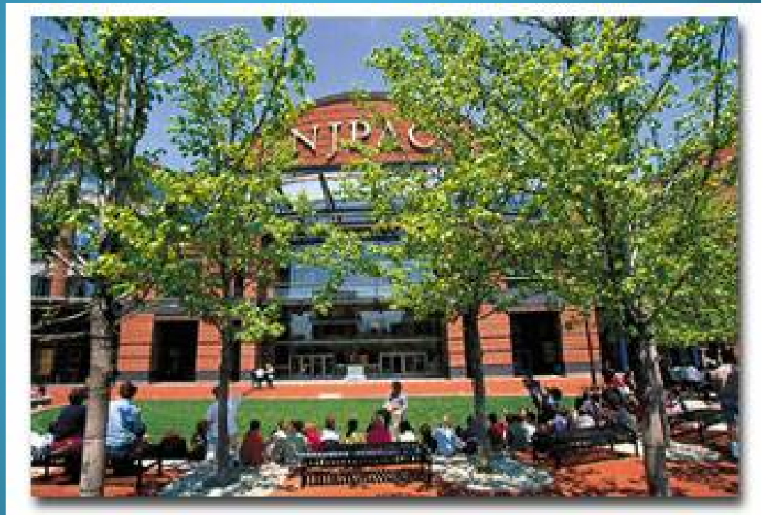
NJ Performing Art Center, Newark