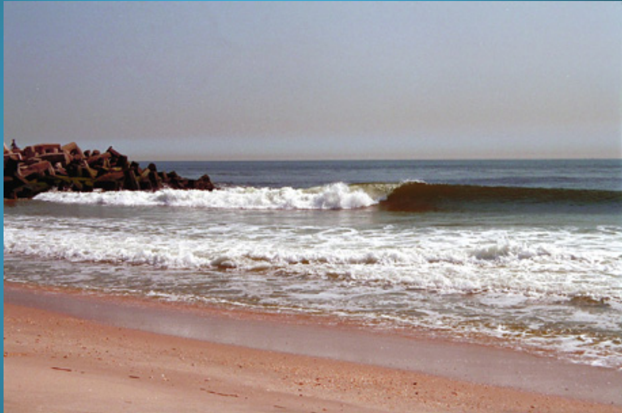
Point Pleasant Beach